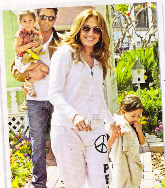
Motherhood made Jennifer Lopez a germaphobe. She always keeps antibacterial wipes handy.